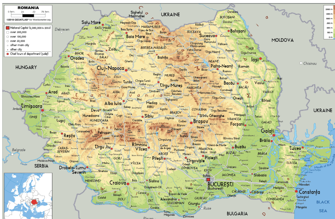
Figure 1: Map of Romania. Source: Worldometer (2025). Map of Romania

Romania, situated in Southeastern Europe, occupies a strategic position at the crossroads of several regions, bordering Ukraine, Moldova, Hungary, Serbia, and Bulgaria. Its 238,397 km 2 landmass, making it a medium-sized European country, is dramatically shaped by the Carpathian Mountains. These mountains act as a natural divide, defining three distinct historical regions: Transylvania, nestled within the mountain arc; Muntenia, stretching south of the range; and Moldova, located east of the Carpathians. This mountainous terrain significantly influences travel within Romania, particularly when relying on ground transportation, as crossing the Carpathians can add considerable time to journeys. The country's administrative structure is composed of counties (județe) and municipalities, each with a level of local governance.